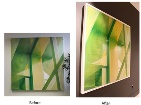
Before and After Framing

To celebrate the relocation, Art Contact took a brief from the Aspect Capital Board of Directors, to commission an original piece of artwork in celebration of the company growth and development. Following a selection process, Wood's Camera Obscure light installation strongly reflected the ethos and core fundamentals of the company. Using their slogan 'The Science of Investment,' as a spring board, Wood's work captures science and light in it's purest form, through a continually evolving artwork. It reacts to changes in light and movement, encouraging both intrigue and inclusion amongst viewers as they look out onto the London sky line. It is a work constantly in the present, if not anticipating the future, sitting proudly in the main reception area. It is a strong reflection of Aspect Capital as a company, at the fore-front of it's field.