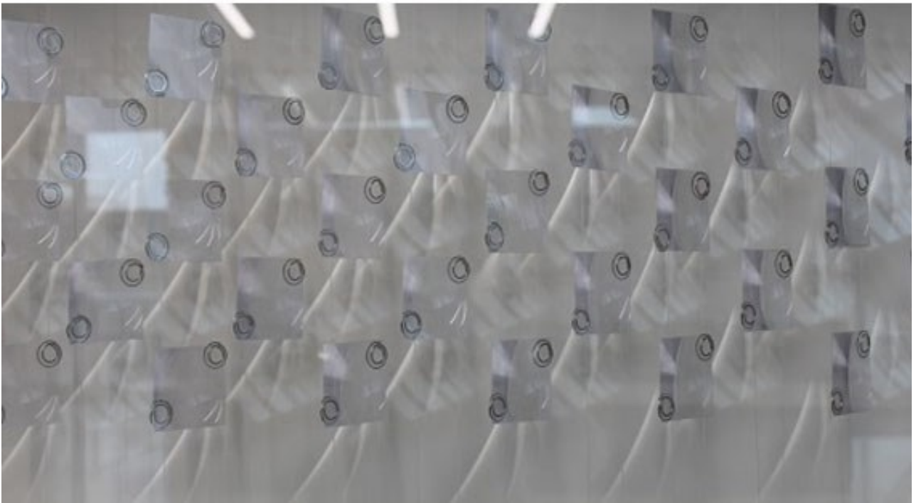
Camera Obscure by Chris Wood