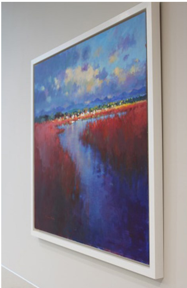
Before and After Framing